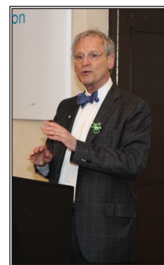
Rep. Earl Blumenauer (D-OR)

Rep. Earl Blumenauer (D-OR), Member, House Ways and Means Committee: Rep. Blumenauer discussed his two transportation-related legislative proposals to raise the gas tax and allow states to voluntarily conduct pilot programs to raise transportation revenue by using a Road Usage Charge (RUC) system based on vehicle miles traveled. While he does not care for the gas tax, he is proposing the tax increase because the Highway Trust Fund needs new revenue now and a RUC-based revenue system would take years to implement. While we are waiting for a RUC system to be created, passed and implemented, we need to ensure our existing system doesn't fall apart. He urged NASHTU attendees to ask Members of Congress tough questions in our Capitol Hill meetings and not to be satisfied with a member or staff person telling them that they support infrastructure because that statement alone is not good enough. He asked that all Congressional meetings get two questions answered. What is the Member's position on raising the gas tax? And what is the Member's solution to the Highway Trust Fund revenue gap? Rep. Blumenauer favors a RUC-based revenue system because it fairly assesses users for the amount of road "use." It is a truer "user fee." He firmly believes that we need a system that charges users based on vehicle miles driven because of fuel efficiency standards and changing driving trends that have significantly impacted the amount of money generated for the Highway Trust Fund.