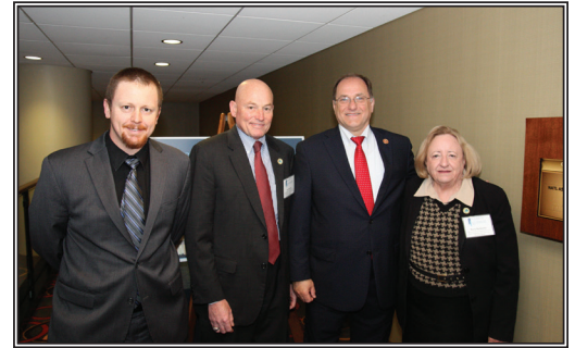
Rep. Michael Capuano with the Massachusetts NASHTU delegation

transportation authorization does not address the revenue shortfall, then the authorization should be another short term bill. Rep. Capuano also discussed the House Panel on P3s. He said he is skeptical on whether P3s are a good deal for taxpayers.