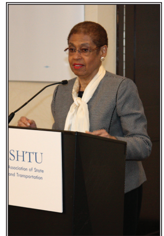
Congresswoman Eleanor Holmes Norton

Congresswoman Norton was critical of transportation public-private partnerships throughout her presentation. She is one of five Democrats who were appointed to the House T&I Special Panel on P3s for Transportation. She gave a summary of the work that the panel is doing and some of the hearings that have been held to date. Some P3s have gone badly around the country. She questioned if we were returning to a highways version of contracting out or outsourcing government services without regard to whether we get anything out of it. She said that no matter what the mechanism is to finance road and bridge construction, the public always pays – either through tolls or taxes. Congresswoman Norton stressed that there is no substitute for investing in our transportation infrastructure, and P3s have yet to prove they have a funding contribution to make.